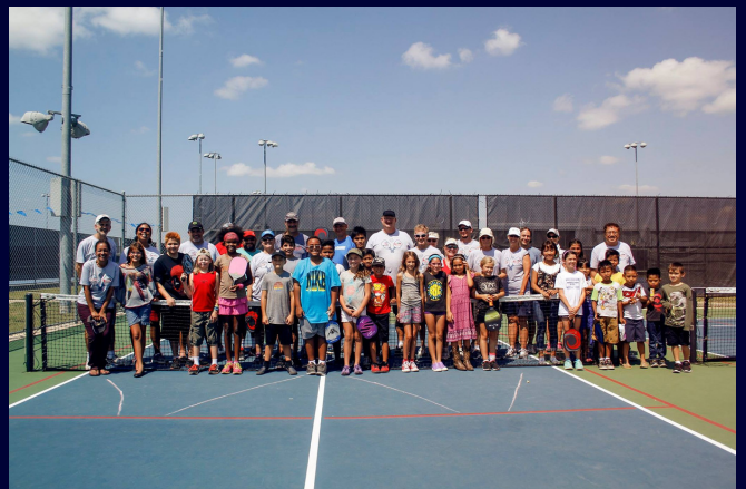
Our very first Welcome Event with our amazing GAP pros and volunteers!