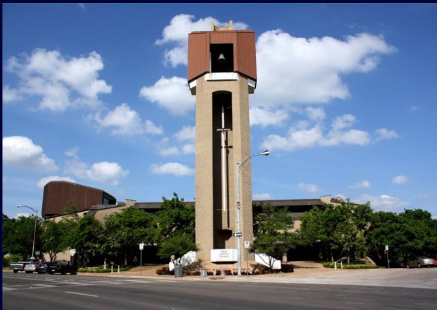
First Austin 901 Trinity St, Austin, TX 78701