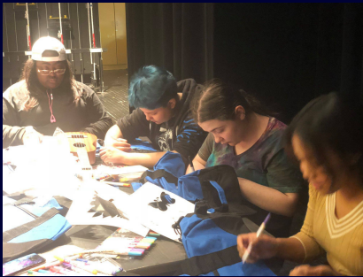
Community service project-assembling birthday boxes and decorating totes for children in foster care through Together We Rise